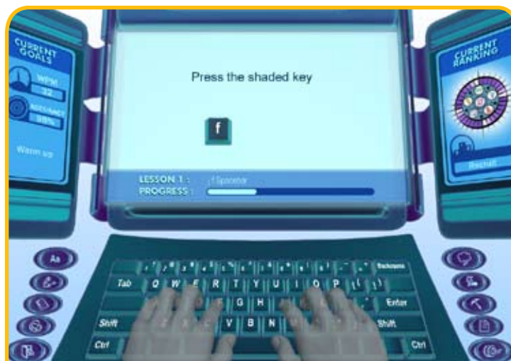
3D hands help students identify the correct hand placement and reaches to new keys.